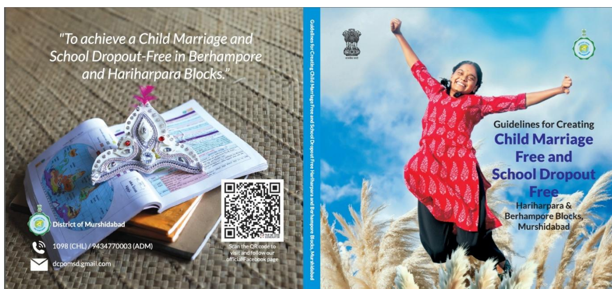
The Guidelines for Creating Child-Marriage free Blocks – Published by District Administration, Murshidabad with collaboration from Child in Need Institute (CINI)

In recognition of its continued efforts in empowering adolescents and supporting the Kanyashree initiative, CINI was honoured by the District Administration as one of the best NGOs in Murshidabad in August 2025