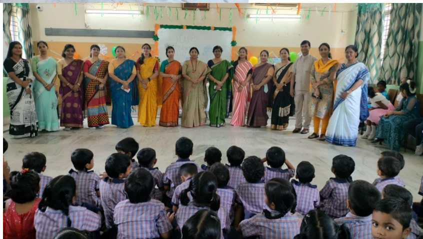
Teacher's Day Celebration