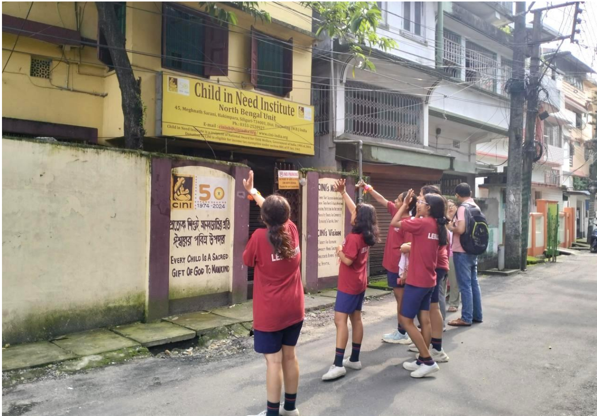
Students of Father LeBlond School, Siliguri , visited our Girls CCI in Siliguri . They spent their valuable time with the children and celebrated with a cake-cutting ceremony on 10 th of August 2025.