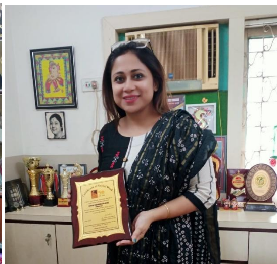
The Headmaster of Scottish Church Collegiate School and The Principal of Bidya Bharati School, Mominpore , received a memento from the CINI representative on 21 st and 20 th August 2025. The schools supported CINI through the generous contributions of its students under the Young Ambassador Program .