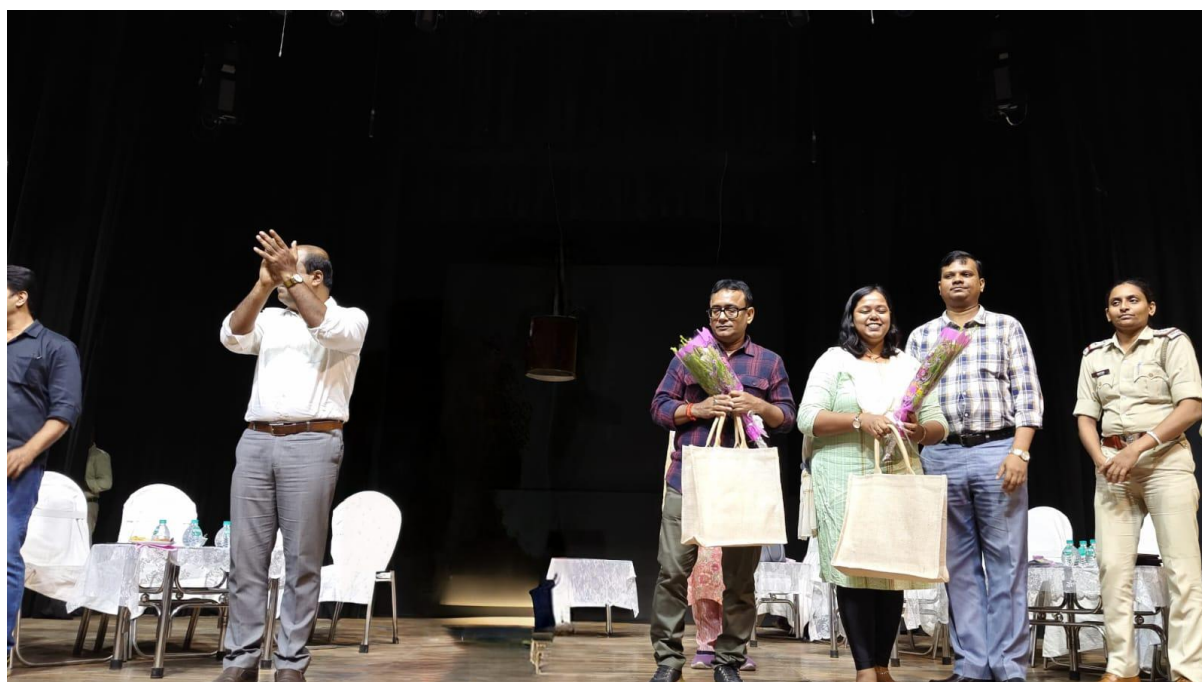
CINI being recognised by District Administration

CINI played a crucial role by identifying vulnerable pockets, formulating execution strategies, and participating in strategic meetings with the administration. Leveraging its longstanding expertise in child-friendly approaches, CINI emphasized that collective action and strong law enforcement are essential to eliminate such social evils.