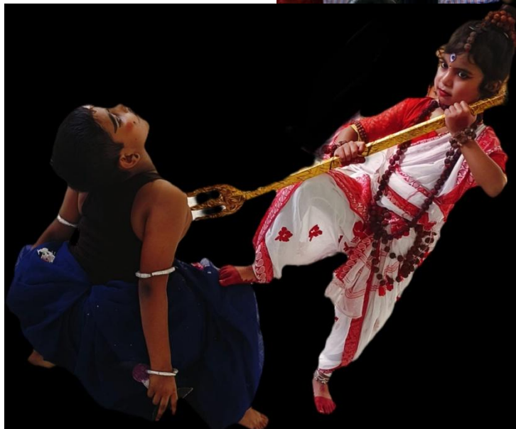
Celebration before Durga Puja Festival Holiday