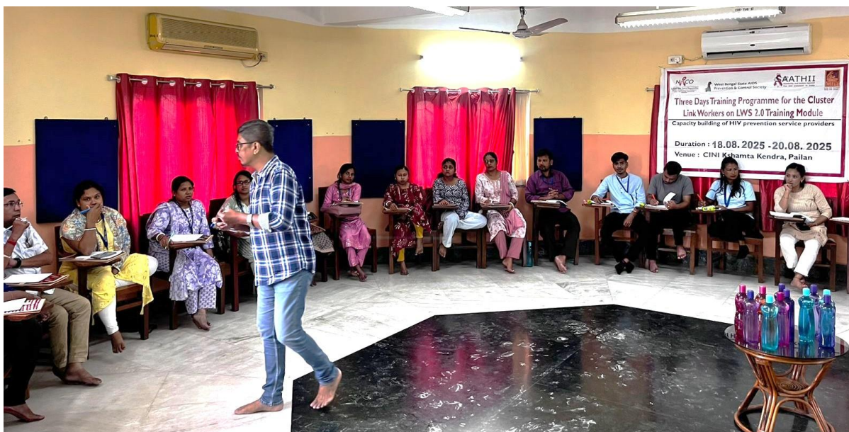
Training of Peer Educators: Under Kshamta Kendra project, CINI State Training Centre conducted Induction Training of Peer Educators from Bridge Population Targeted Intervention NGOs under West Bengal SACS with 33 participants.