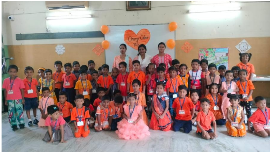
Orange Colour Day