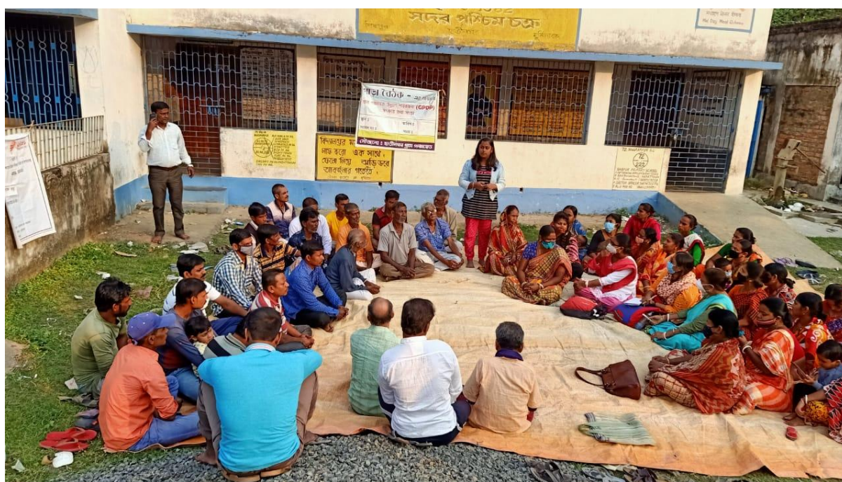
Facilitating 'Para Baithak' at Hatinagar Gram Panchayat, Murshidabad

CINI works closely with Gram Panchayats to ensure inclusive and sustainable rural development by enhancing their role in public health, nutrition, education, child protection, social welfare and climate action. By building capacities, facilitating data-based planning, and supporting community engagement, CINI enables Panchayats to integrate social development priorities into their annual planning and budgeting processes called the Gram Panchayat Development Plan or GPDP. Regular support in organizing statutory and community meetings ensures voices from the grassroots—especially women and children—are heard and acted upon. Encouraging the use of local resources and available funds, CINI fosters innovative, sustainable solutions tailored to community needs. These efforts not only institutionalize human development at the grassroots but also contribute to key Sustainable Development goals: Zero Hunger, Good Health, Quality Education, Gender Equality, and Climate Action—laying the foundation for healthier, safer, and more child-friendly rural communities.